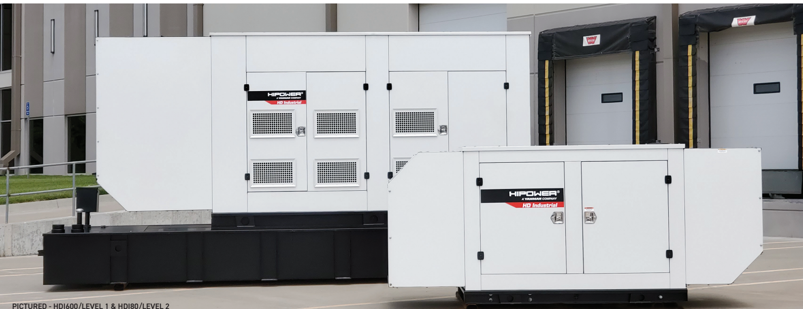
PICTURED - HDI600/LEVEL 1 & HDI80/LEVEL 2

HIPOWER SYSTEMS is committed to delivering robust and reliable Heavy Duty Industrial Diesel Standby generators to the power generation industry throughout North America. We stand behind every machine we make. That is why all our generators come with a standard 2 years or 2,000 hours (whichever occurs first) parts and labor limited warranty.