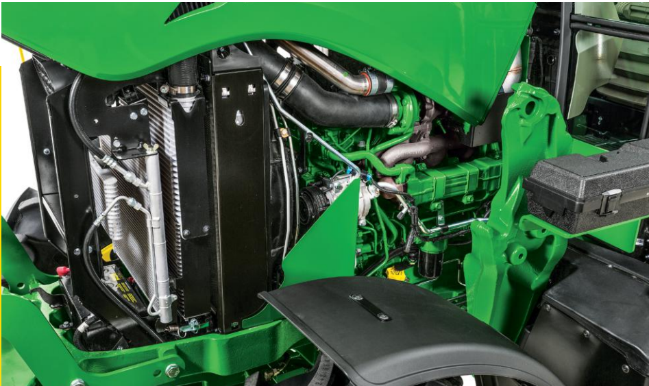
Simple to service ... it's a big part of the 6E value story. Regular maintenance checks are easy so you can get on the job quick. The lifetime DPF filter won't require costly or time-consuming replacement either.

Every 6E Series Tractor is backed by the trusted John Deere name ... and a two-year, 2,000-hour warranty. ±