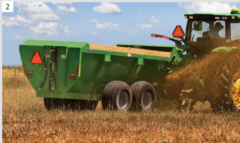
1. Handle large round bales with a 6E Tractor and a Frontier Equipment Bale Carrier. BC1108 Bale Carrier shown.