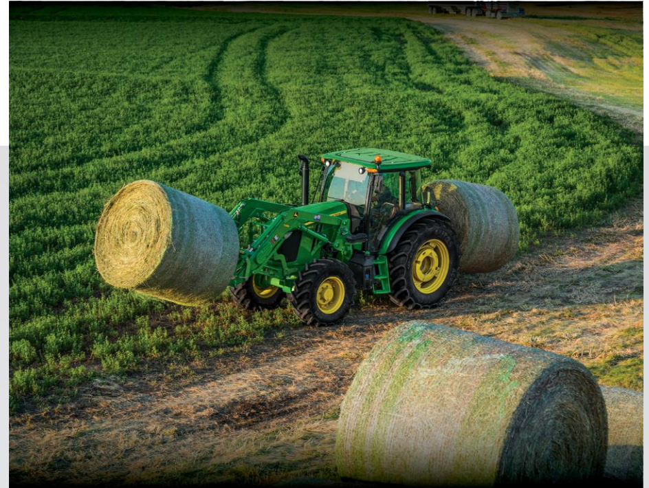
With 3,946 pounds (1789 kg) of lift capacity, an H Series Loader handles round bales ... and can even lift and stack two 5X6 bales easily.