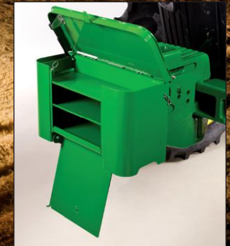
Tractor Utility Box With loads of capacity, two removable shelves and innovative front door and lid design, this new tractor utility box breaks new ground for convenience, versatility and rugged design.