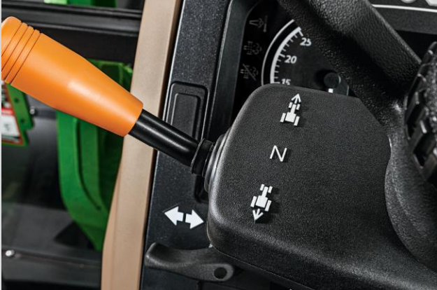
The PowrReverser helps you smoothly change directions without needing to change gears or touch the clutch ... a must have for fast loader work.