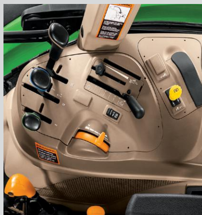
The conveniently located console makes operating the hitch intuitive. Raise and lower the hitch with the control lever and set the stop knob for preset depth.