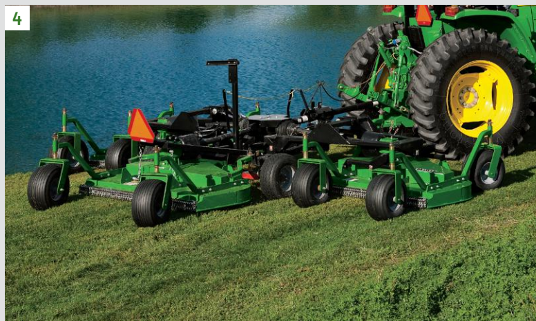
3. Save money by grinding and mixing your own feed with a 6E Tractor and a Frontier Equipment Grinder Mixer. GX1117 Grinder Mixer shown.