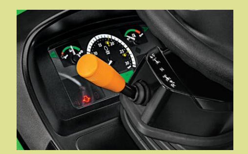
The PowrReverser™ Transmission option. This 12F/12R gear drive transmission features a reverser lever located by the left side of the steering wheel for direction changes with a foot throttle to free hands for loader work, steering and direction changes.