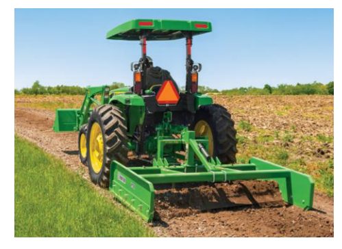
4052M Tractor with a canopy, front loader and wheel weights. ShadePro Canopy with optional fan is even cooler. See page 4.