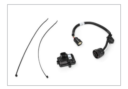
TractorPlus™ app. Better tools. Better information. With the TractorPlus™ App you'll get maintenance recommendations, tutorial videos and more. Available on all 4 Series Tractors. Download at the Apple Store or at Google Play.

The Smart Connector option enhances the user experience of the TractorPlus™ app by adding several features that help operators use and maintain equipment more efficiently.