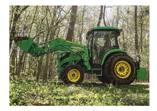
4075R Tractor with 440R Mechanical Self-Leveling Loader (MSL), cab, heat and A/C and pallet forks. See page 8.